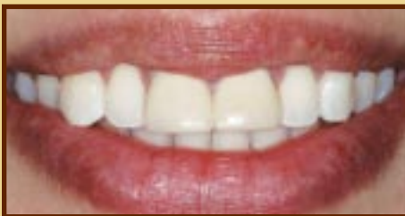
crowns & veneers

● Create a more balanced and symmetrical gumline with veneers or gum sculpting. Whether your gums have begun to recede or you have been longing to reveal the beautiful enamel under too much gum, we have a technique that will work for you.